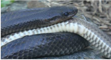
SLATEY-GREY SNAKE Stegonotus cucullatus