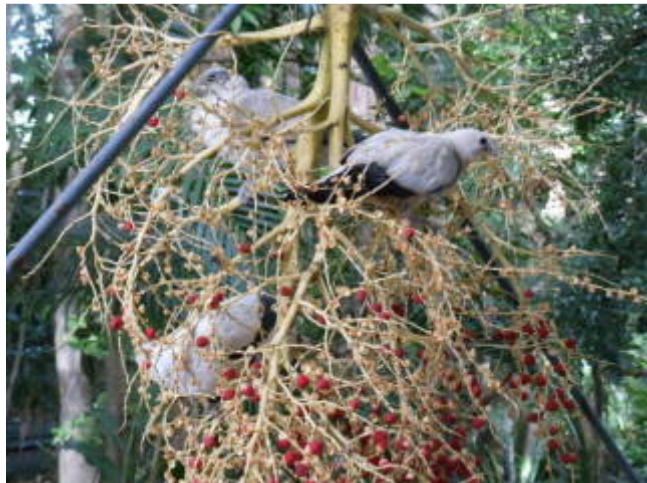
Released Pied Imperial Pigeons, Machan's Beach, Cairns