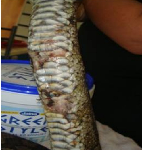
Some of the initial injuries, this type of wound covered over a 1/3 rd of the body

Kylee as one of our local snake remover / rescuers is often dropping in little (sometimes not so little) surprises. She rang to say she had a python with a nasty infected mouth (canker) and infected wounds over the body. Well - for those with sensitive tummies you may want to skip to the last paragraph.