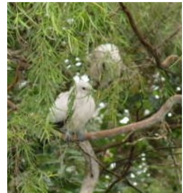
Released Pied Imperial Pigeons, Machan's Beach, Cairns