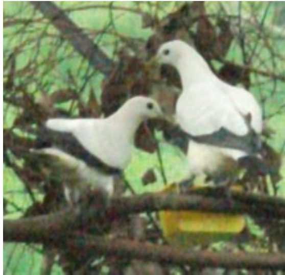
Pie 1 & 2