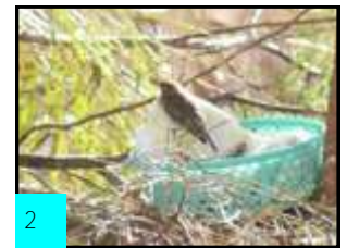
Moses:(1) Feeding on the nectivore mix! (2)Free! (Photographic Rating: 1 out of 10. Carer Rating: 15 out of 10!)