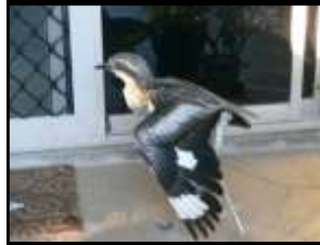
Quinton: Not only 'wild' birds enjoy our baths. On 14/4/08 we received a Bush Stone-Curlew (ID = Quinton). Photo 1 shows him on that first day - meal-worms at his feet! The next photo, taken 180 days after release shows him enjoying the comforts of home.

The final photo was taken on 1/8/09, 408 days after 'Release'. By that time the dry season had kicked in and it had been over 4 weeks since we had any rain.