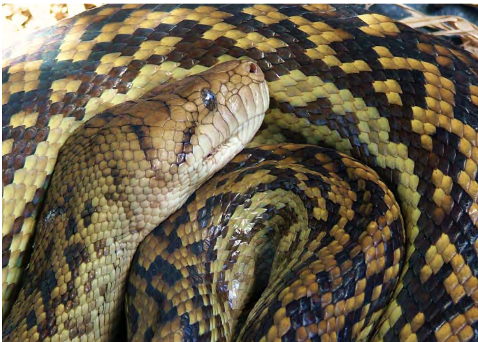
A scrub python recuperating at Linden's. Story page 4