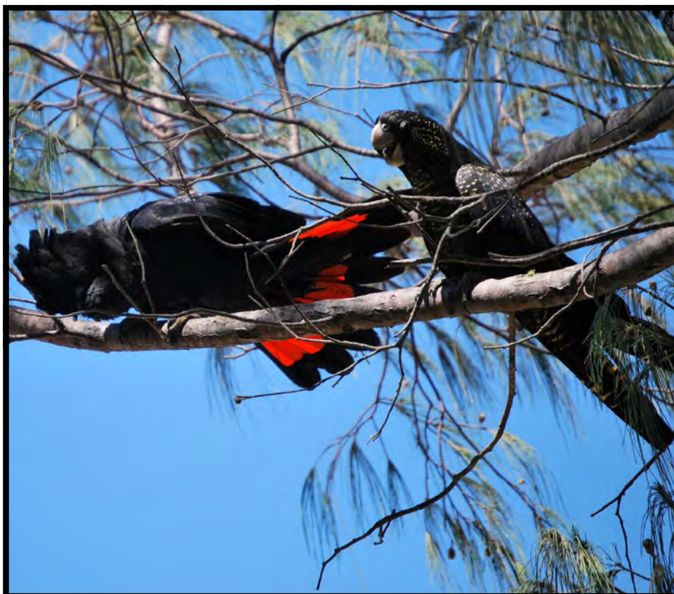
Red Tailed Black Cockatoos at Conway Beach